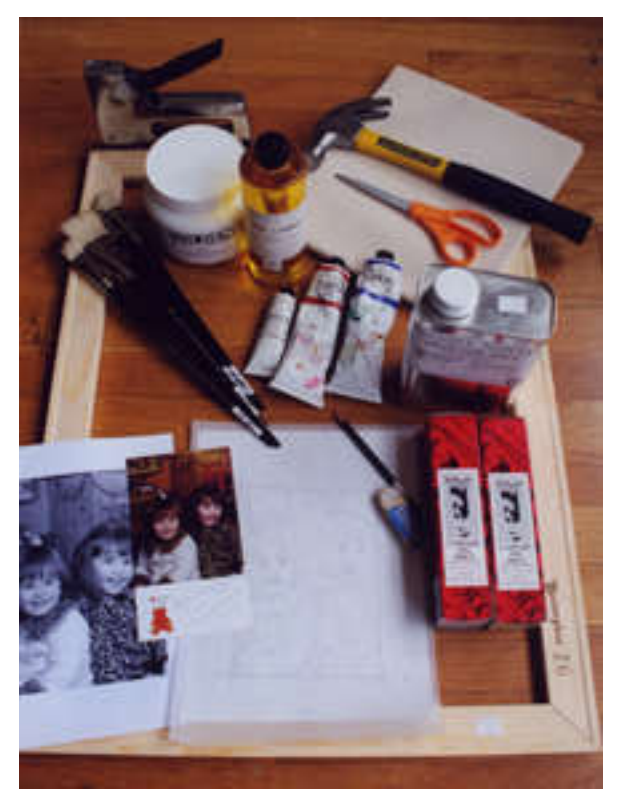
Here is a sample of some of the supplies I use in completing an oil portrait.