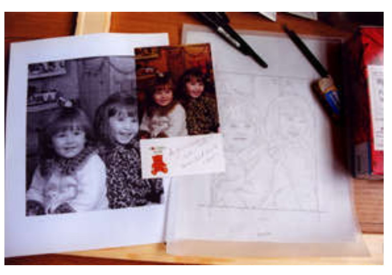
I begin by first completing a line drawing of my subject, working from photographs provided by the client.