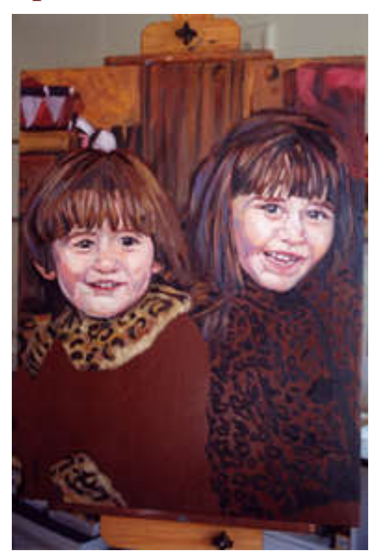
Next begins the painting process. I like to work various parts of the canvas, slowly bringing the painting into focus.