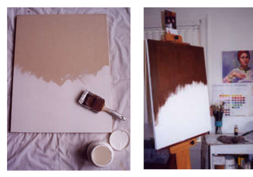
Next the stretched canvas is covered in several layers of gesso making it able to be painted on in oil, and finally I apply a dark layer of oil paint mixed with linseed oil as I prefer to work on a toned surface.