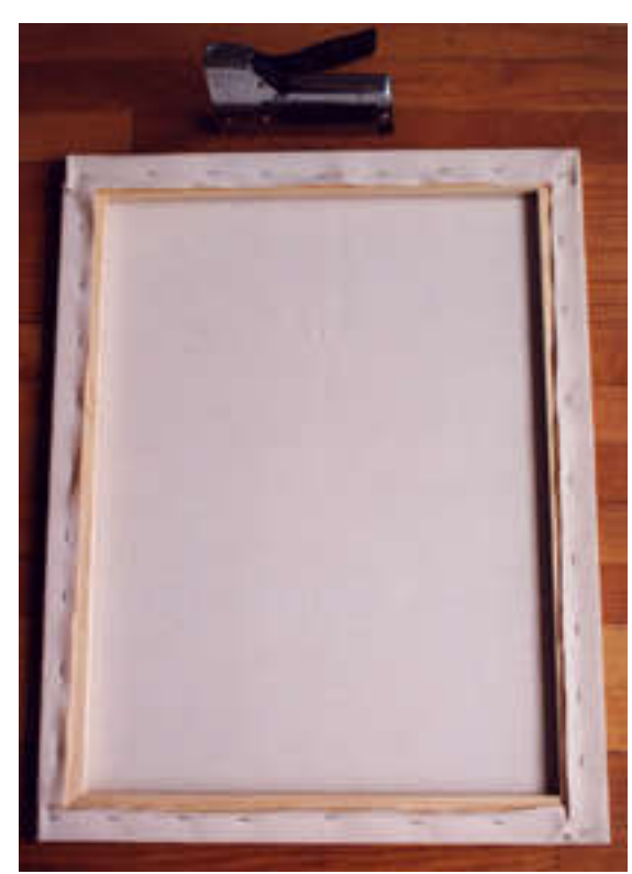
After completing the drawing and calculating the size and dimensions of the portrait, I build the canvas.