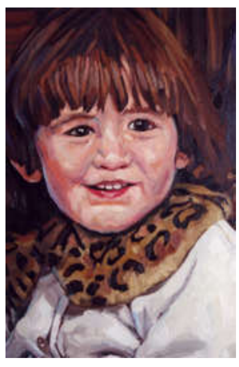
A detail of the painting near completion.